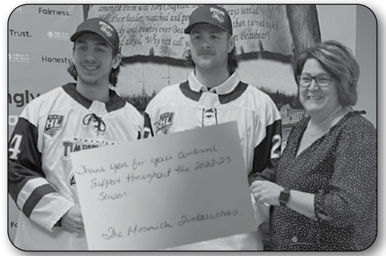
Support for the Miramichi Timberwolves Hockey Team