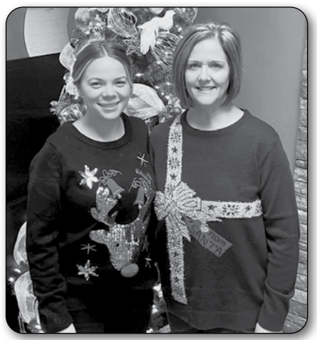
Ugly Sweater Day